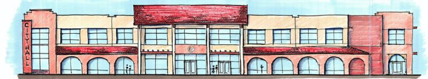
SAN PABLO CITY HALL – ELEVATION CONCEPT