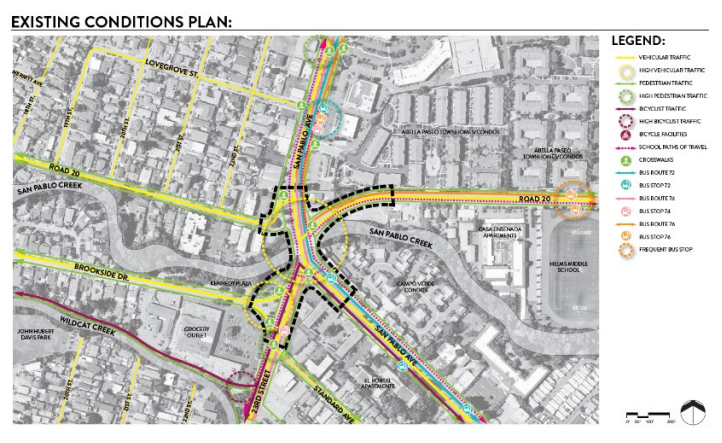
San Pablo Avenue Bridge Replacement and Intersection Realignment Project

Additional Federal funding is needed to construct this project. The City submitted a grant application in January 2025 for the U.S. Department of Transportation's (USDOT) Better Utilizing Investments to Leverage Development (BUILD) Grant Program funding, previously known as the Rebuilding American Infrastructure with Sustainability and Equity (RAISE) and Transportation Investment Generating Economic Recovery (TIGER) discretionary grants.