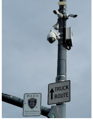
High-Tech Tools Help San Pablo Police Track Down Criminals Faster