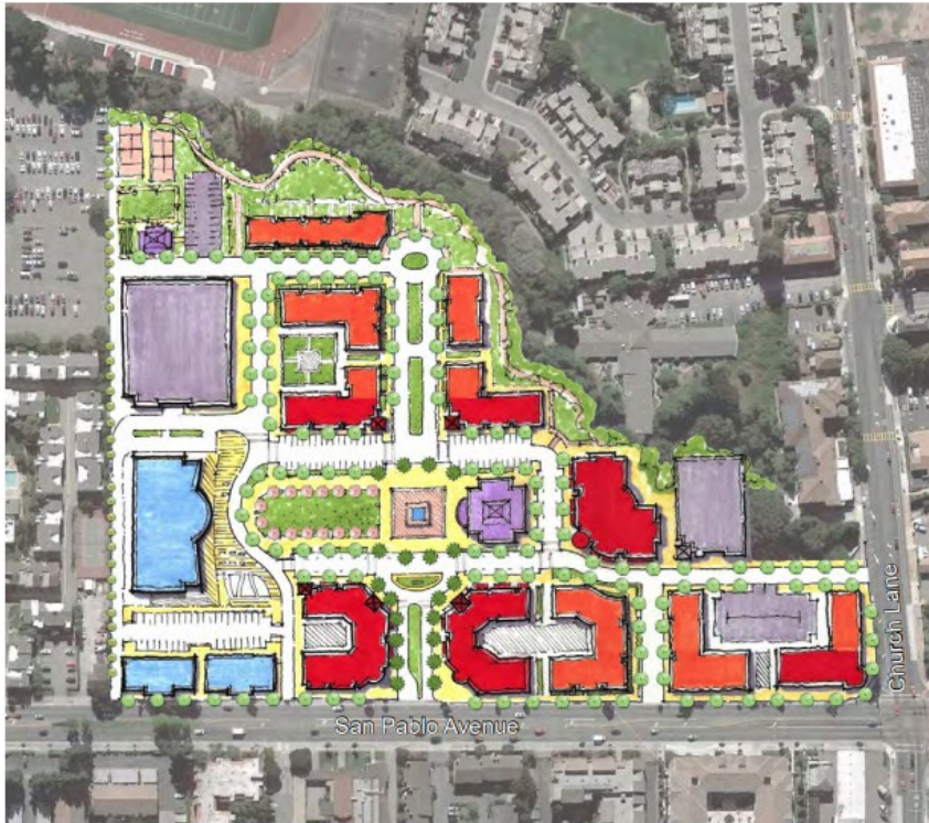
Illustration 1.2.2 Envisioned Redevelopment Masterplan