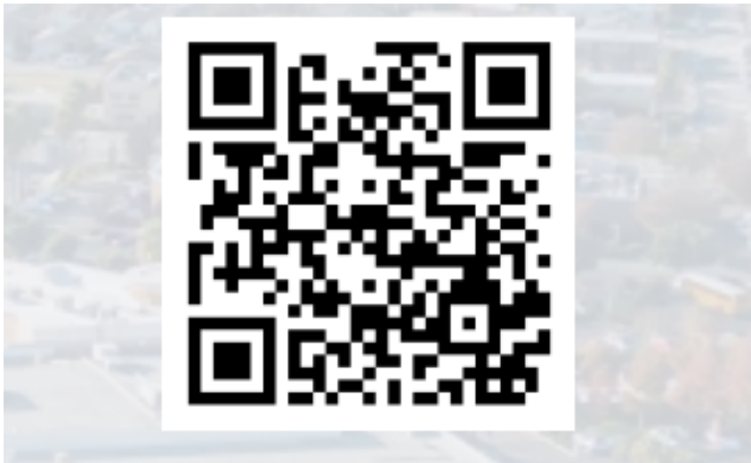
Rental Housing Regulations Guide