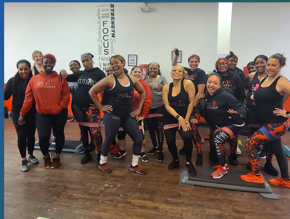
2021 Small Business of the Year – Get It Girl Fitness

Supporting local businesses means supporting jobs, and capturing disposable income from the surrounding area