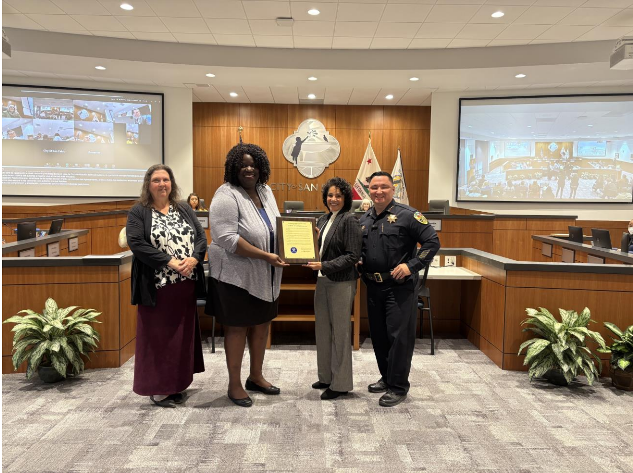
PHO PRC Presentation Autism Awareness 2026-04-06